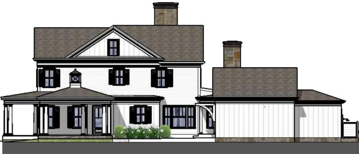
HYDRANGEA HALL Right Elevation