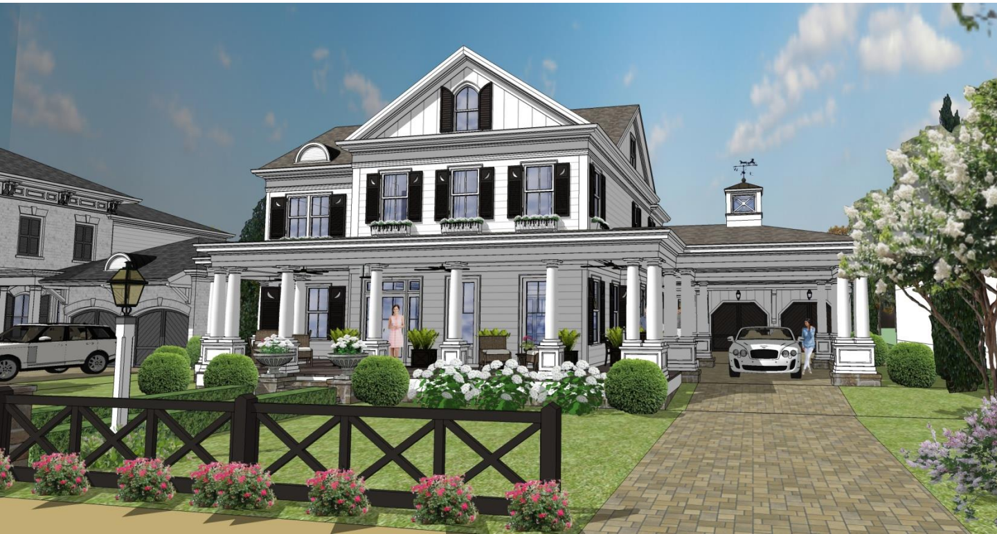
HYDRANGEA HALL Perspective 6