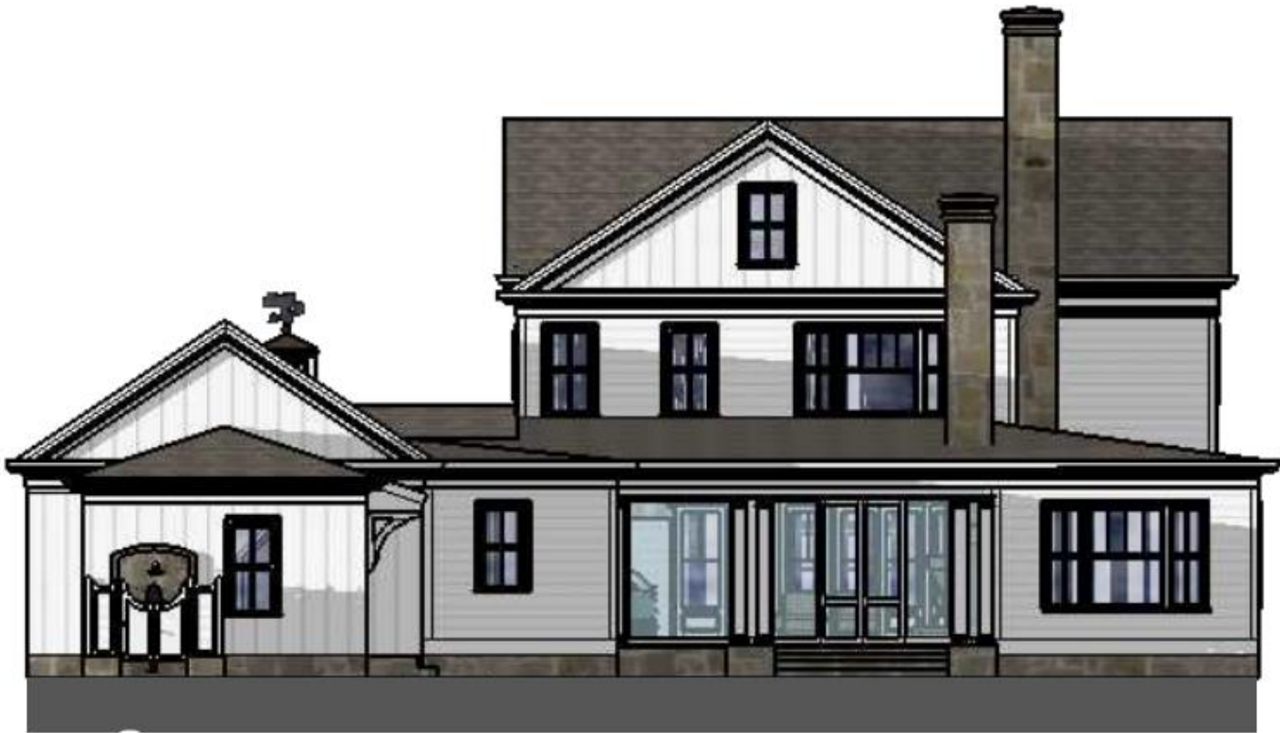
HYDRANGEA HALL Rear Elevation