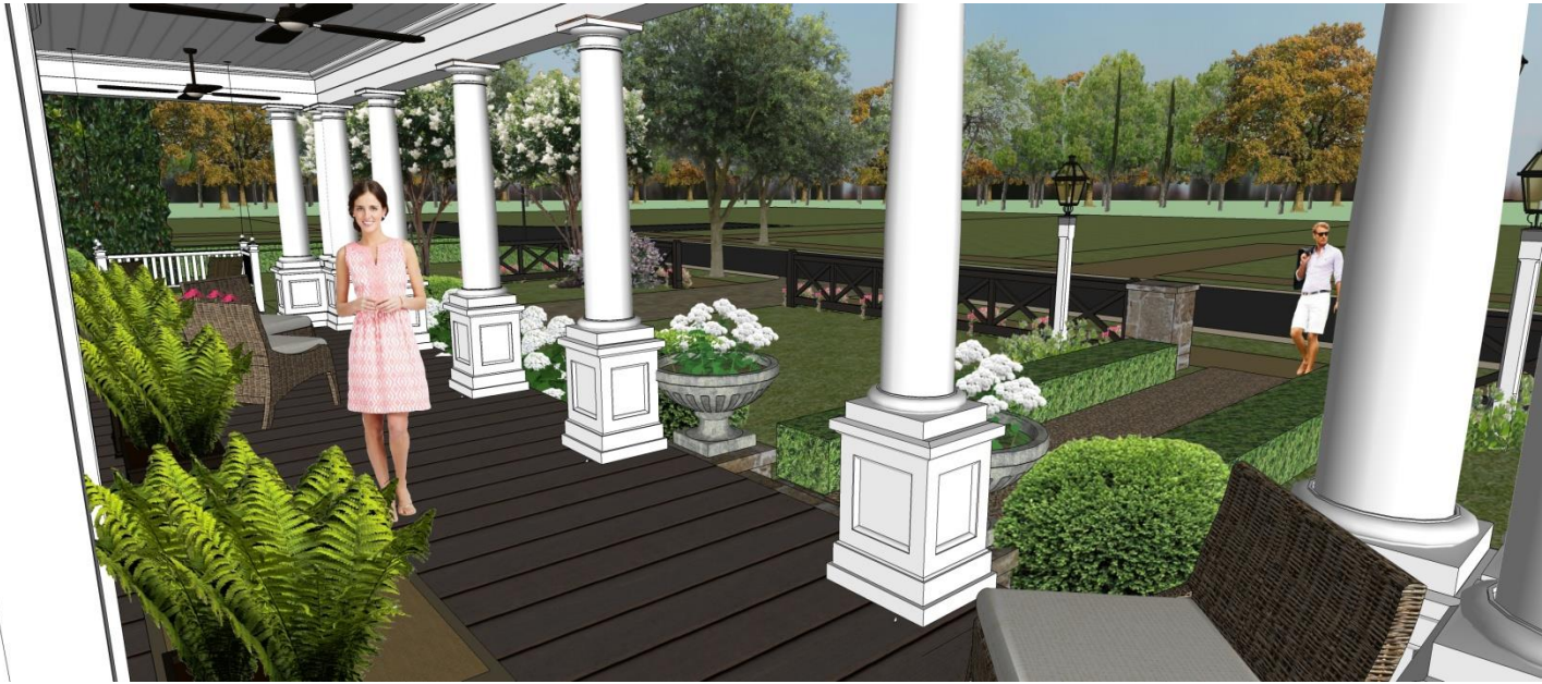
HYDRANGEA HALL Perspective 17