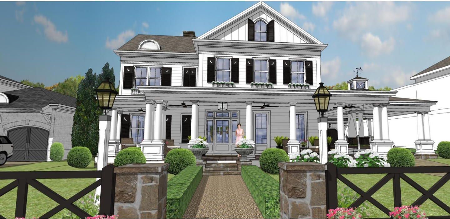
HYDRANGEA HALL Perspective 7