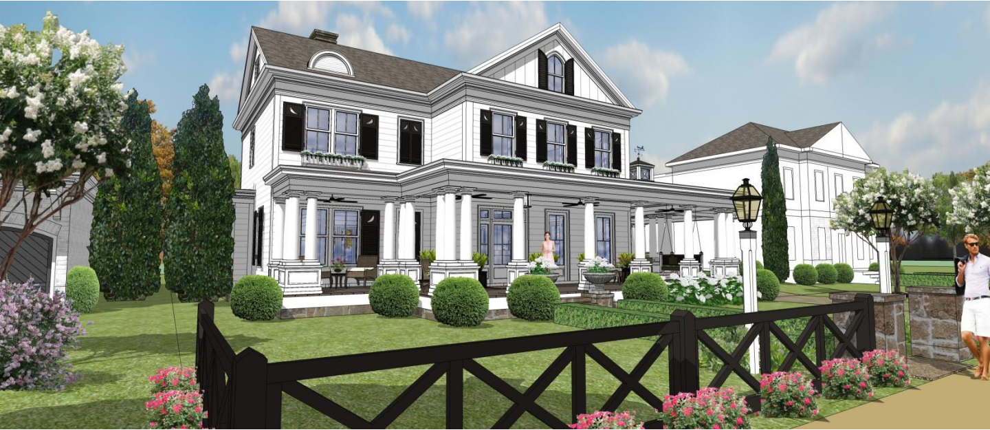
HYDRANGEA HALL Perspective 4