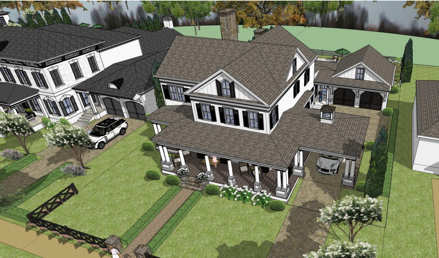
HYDRANGEA HALL Perspective 2