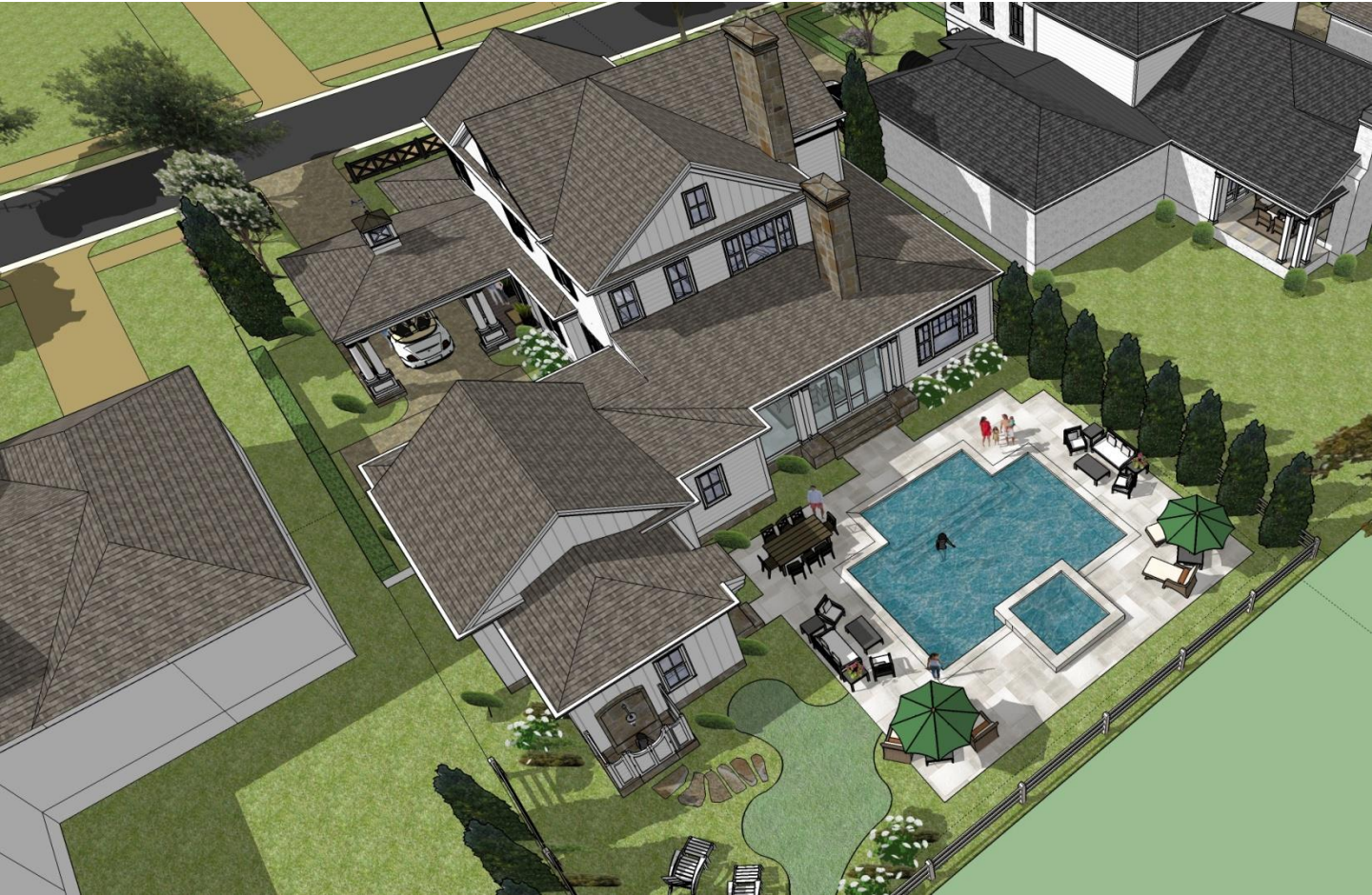
HYDRANGEA HALL Perspective 3