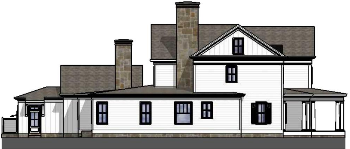
HYDRANGEA HALL Left Elevation