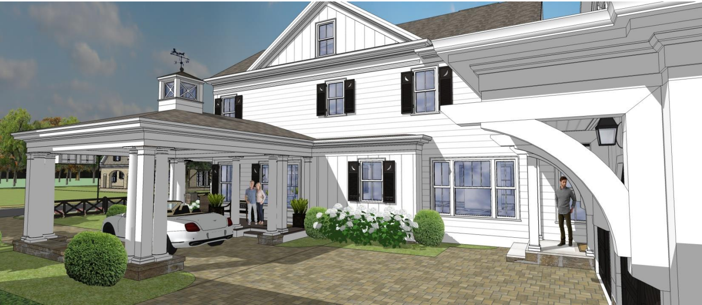
HYDRANGEA HALL Perspective 12