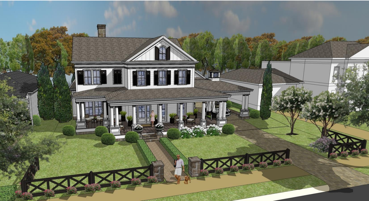
HYDRANGEA HALL Perspective 1