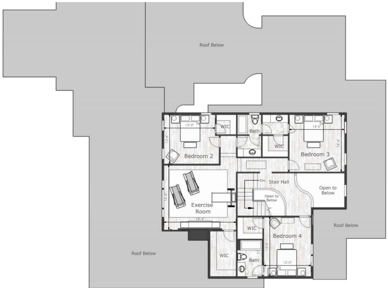
HYDRANGEA HALL Upper Level Floor Plan