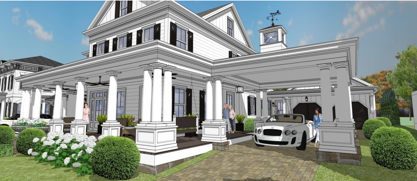
HYDRANGEA HALL Perspective 9