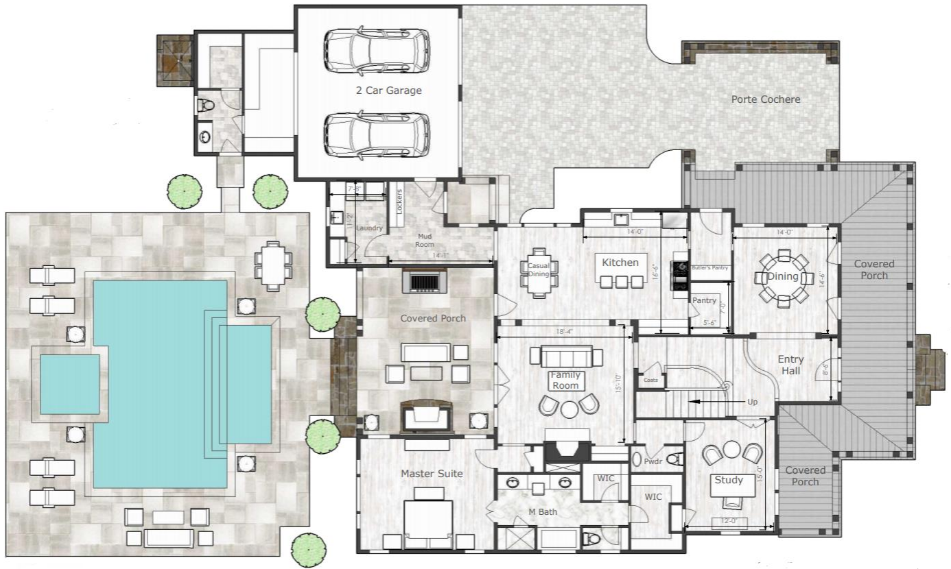
HYDRANGEA HALL Main Level Floor Plan