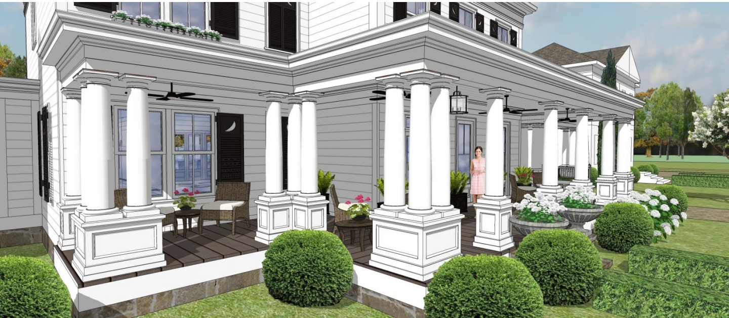
HYDRANGEA HALL Perspective 15