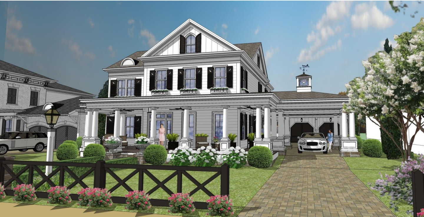
HYDRANGEA HALL Front Elevation