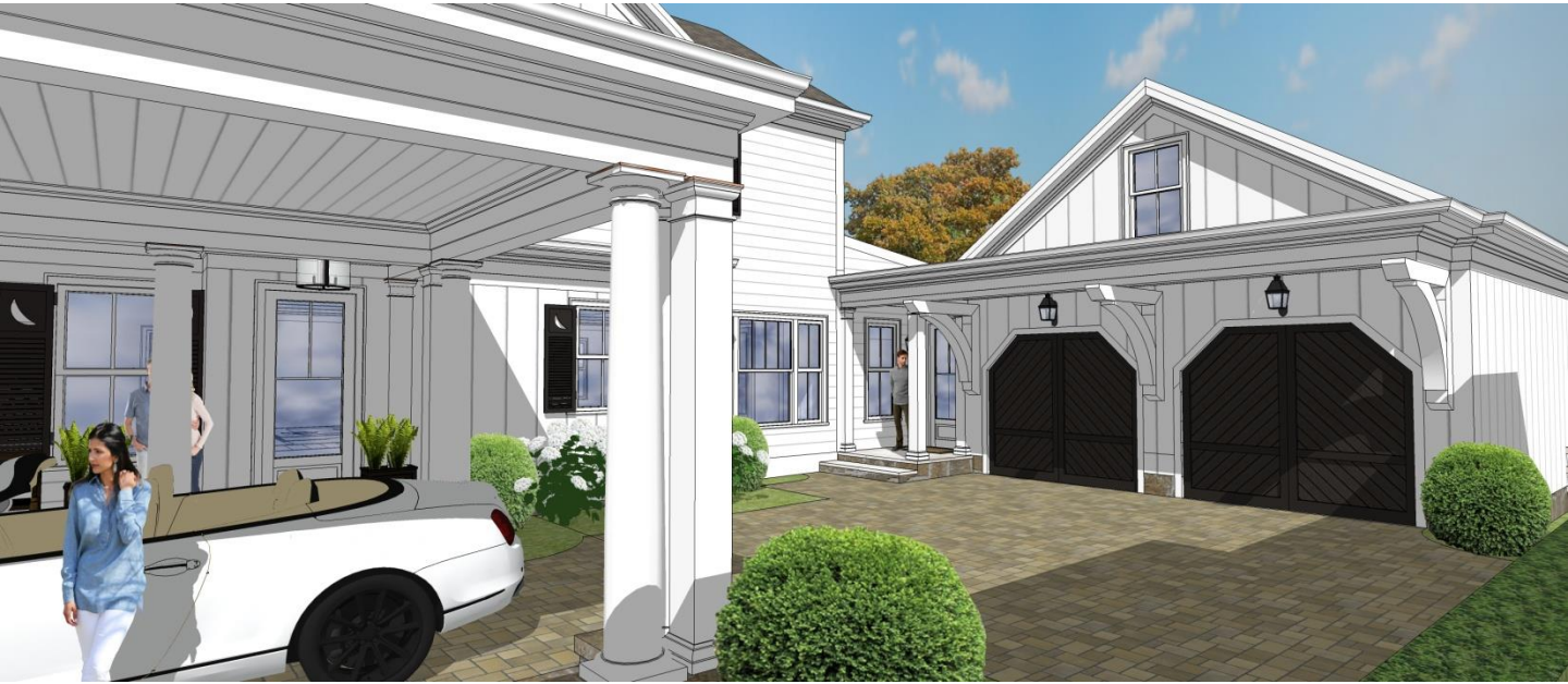
HYDRANGEA HALL Perspective 11