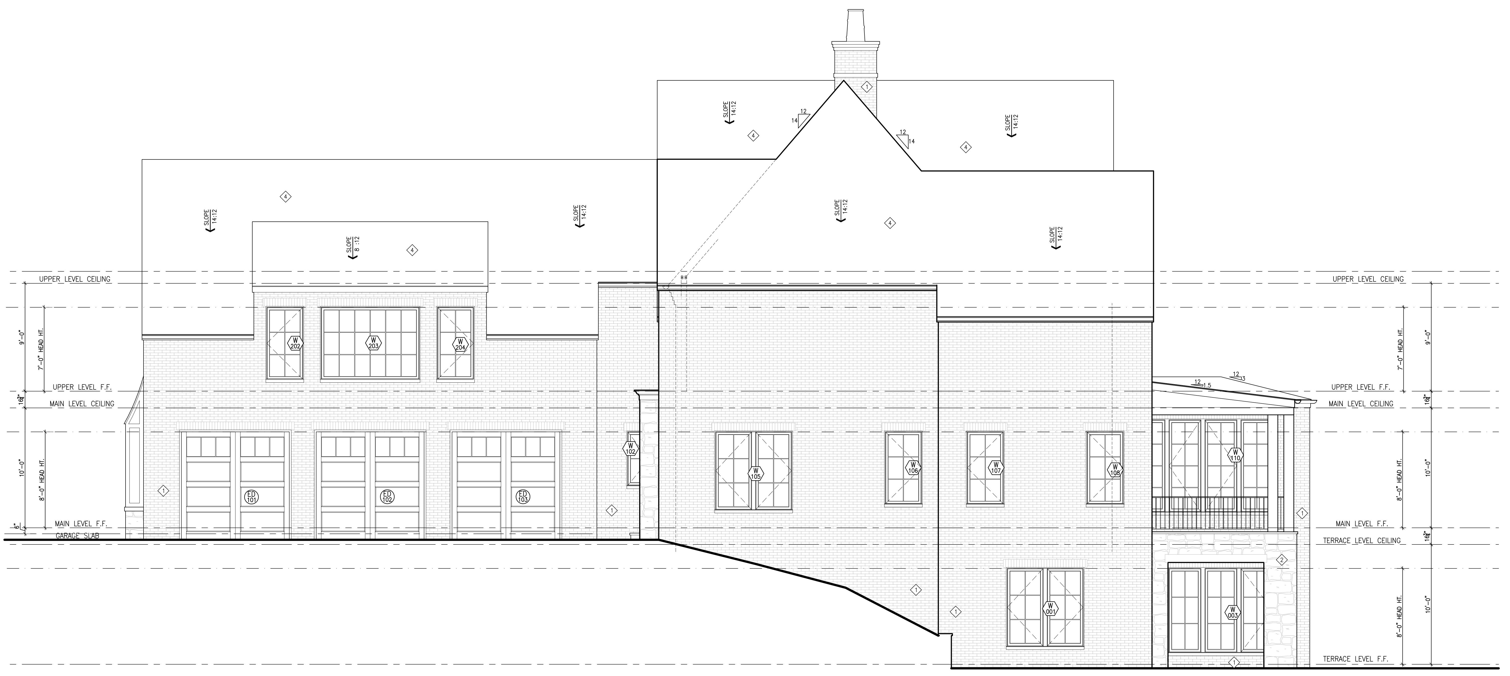
1 RIGHT ELEVATION A-3.000 SCALE: 1/4" = 1'-0"