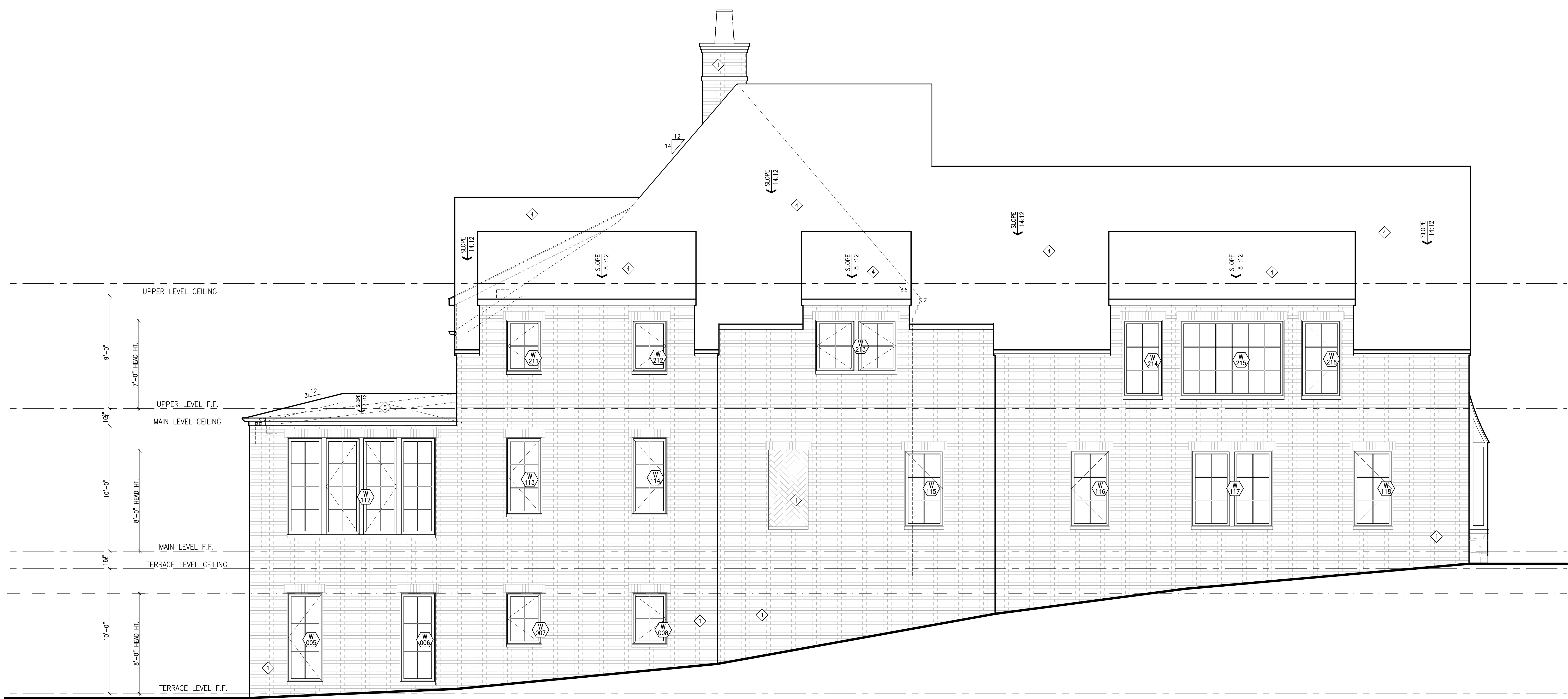
1 LEFT ELEVATION A-3.001 SCALE: 1/4" = 1'-0"