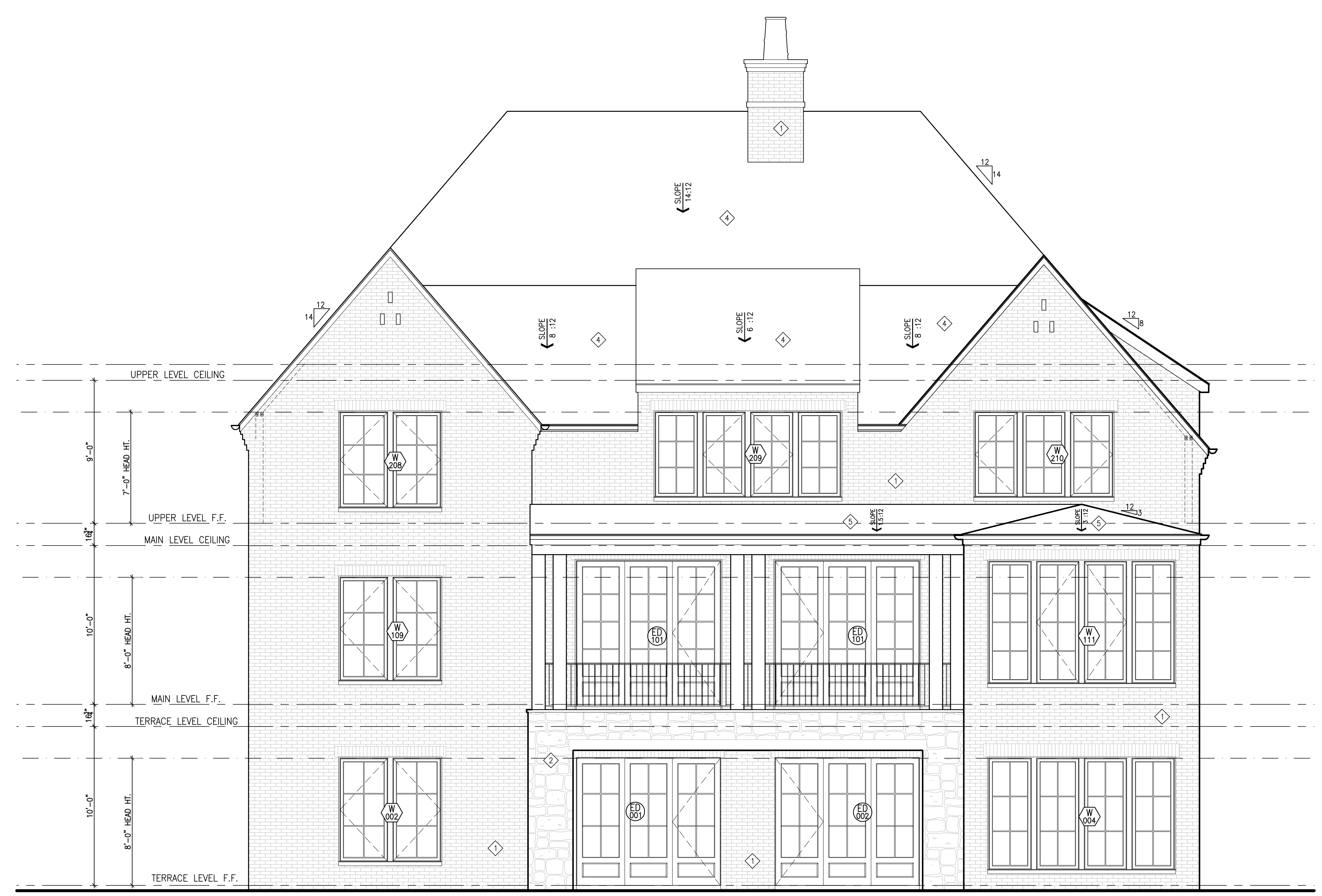
1 REAR ELEVATION A-3.001 SCALE: 1/4" = 1'-0"