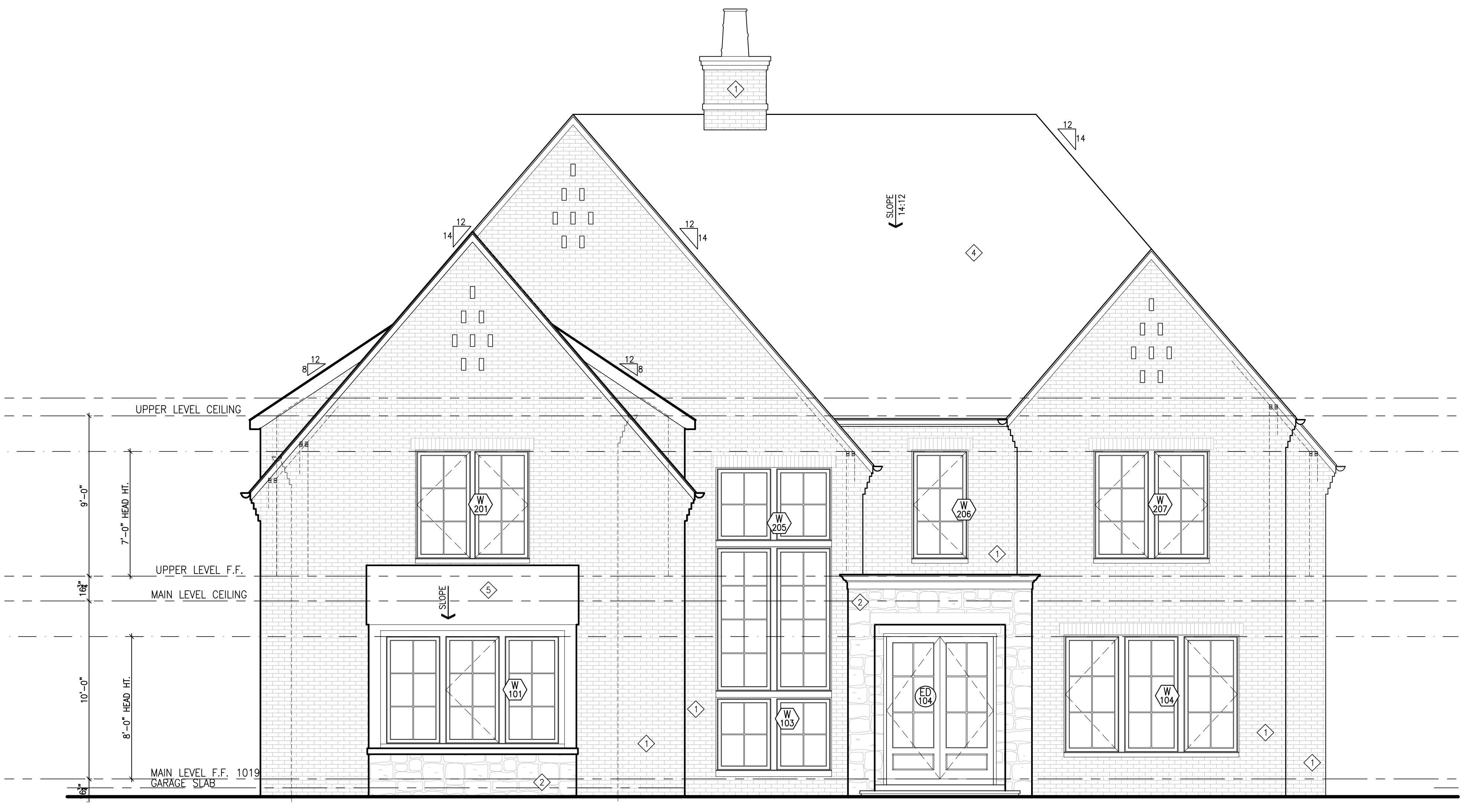
1 FRONT ELEVATION A-3.000 SCALE: 1/4" = 1'-0"